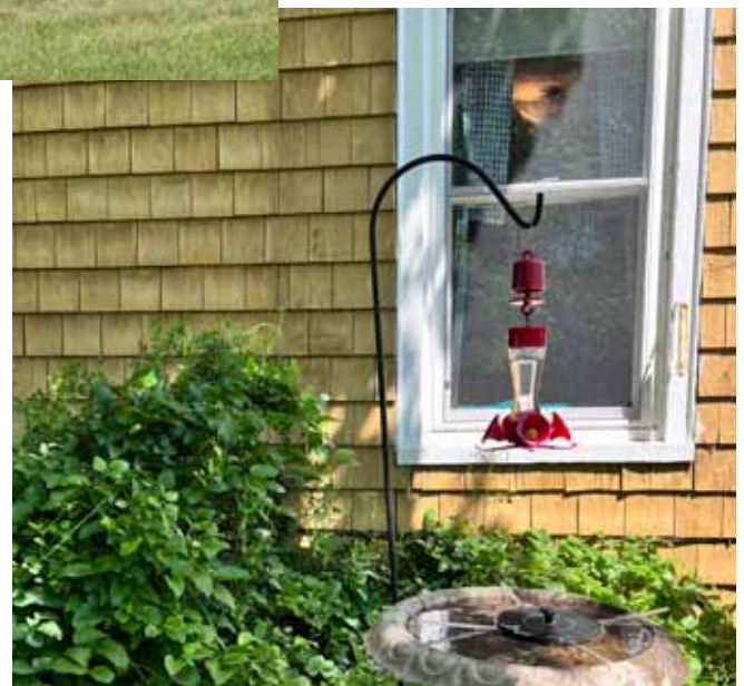
Spring comes, finally. I'm ready for the hummingbirds, but haven't seen one yet