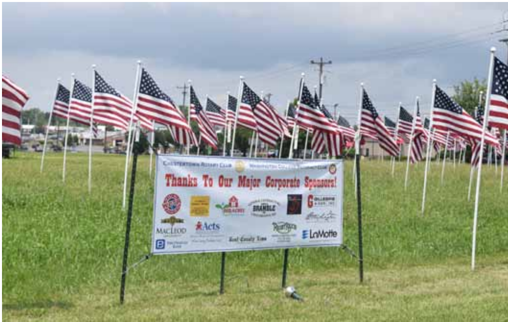
Each year for Memorial Day the Chestertown Rotary Club does a flag display on a prominent corner of the area in memory of fallen. Each flag is displayed in memory of someone, but the effect of all those flags waving in the breeze is quite moving.